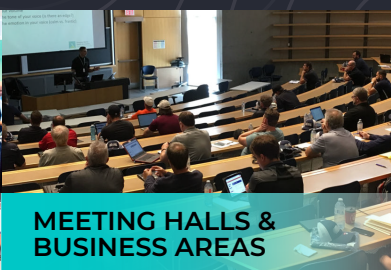
MEETING HALLS & BUSINESS AREAS