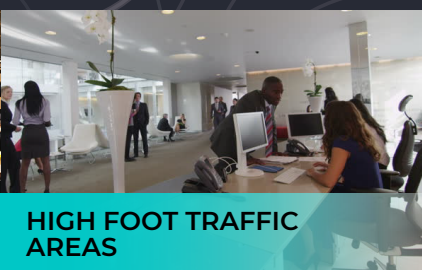
HIGH FOOT TRAFFIC AREAS